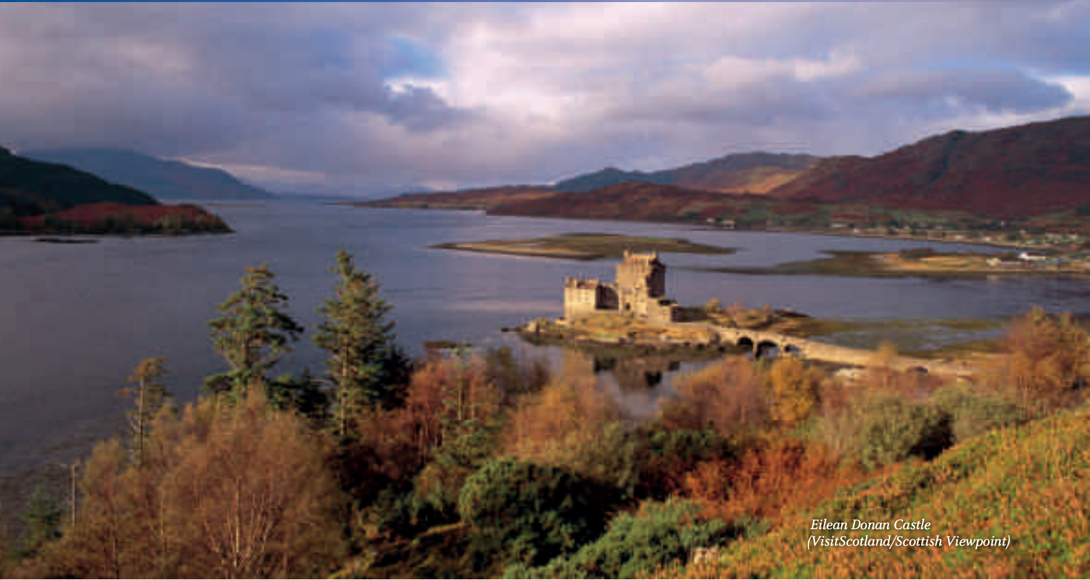
Eilean Donan Castle